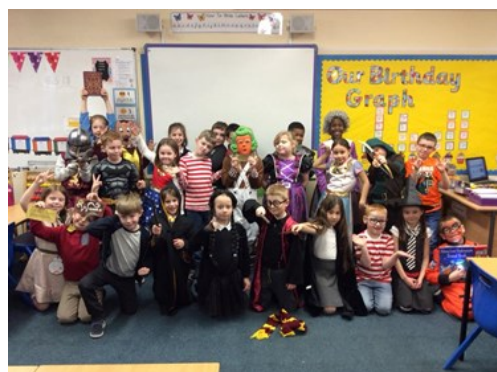
Frettenham Sport Afternoon