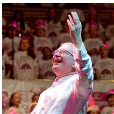
Enjoying the opportunity to sing in the Young Voices Choir