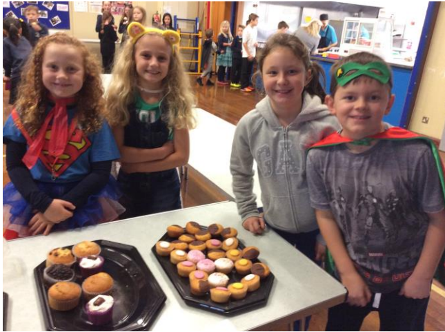
Cake sale in action.