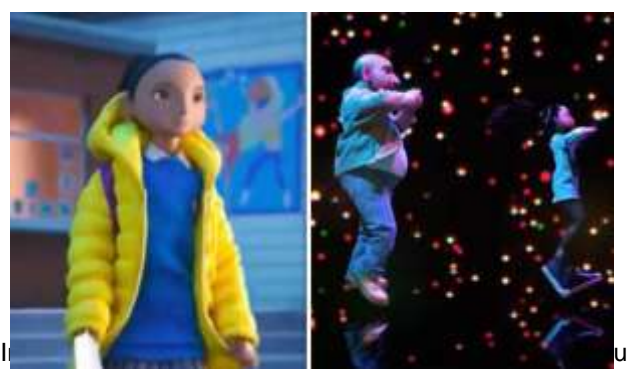
vocabulary and 'big up' our sentences to make them more interesting!

Click on the link above, which will take you to the video. Watch it with your family and then have a discussion about the meaning behind the video. What are the key messages? How does the video relate to Christmas and what do you like about it?