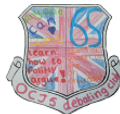
Old Catton Debating Society Established 2013