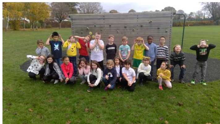
The children enjoying Children in Need day!