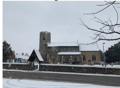
St Margaret's Church