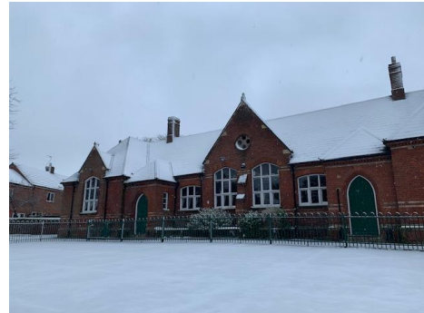
Our school looking beautiful in the snow