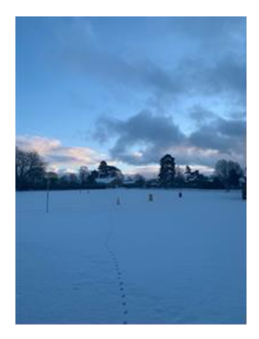
View across the school field

What a week it has been. The snow came and just kept coming, meaning that we had to close school completely on Monday and Tuesday this week. This is never something that we want to have to do but the roads and conditions outside meant that it just wasn't safe enough for staff to be able to come into school.