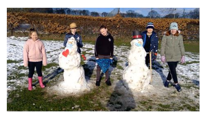
The Year 5 Bubble snowmen!