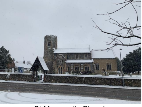
St Margaret's Church

Our school looking beautiful in the snow